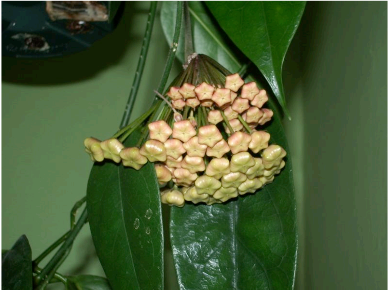
Figure 4: The developing buds are a rich buttery yellow, with pink, orange, and copper tones when exposed to direct sunlight.

Hoya fraterna is a tough, vigorous plant which presents no serious challenges in cultivation. Despite its moist forest background, it is quite adaptable and seems equally at home as a houseplant or in a warm greenhouse. H. fraterna does like consistent watering, and will dry out and wilt more quickly than many Hoyas due to its relatively thin leaves and fine stems. The soil for this plant should never be allowed to dry out completely, and any period of drought will cause desiccation and blasting of flower buds. H. fraterna , when properly sited, will flower on and off throughout the year.