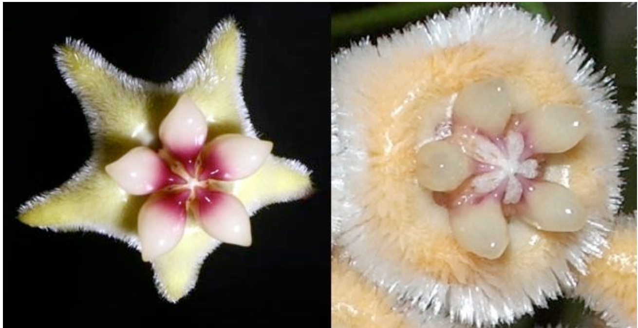
Figure 1: Hoya coriacea Blume (L) and Hoya fraterna Blume (R). Note the differing coronal lobe shapes- H. coriacea 's lobes point outwards, while H. fraterna 's are upright and blunt.

Hoya fraterna Blume is intimately associated with two other Hoyas- Hoya coriacea Blume, to which it is very closely related and visually very similar, and Hoya meliflua Merr. ssp. fraterna T. Green, which was mistakenly identified as Hoya fraterna around 1850, an error which was to remain uncorrected for almost 150 years.