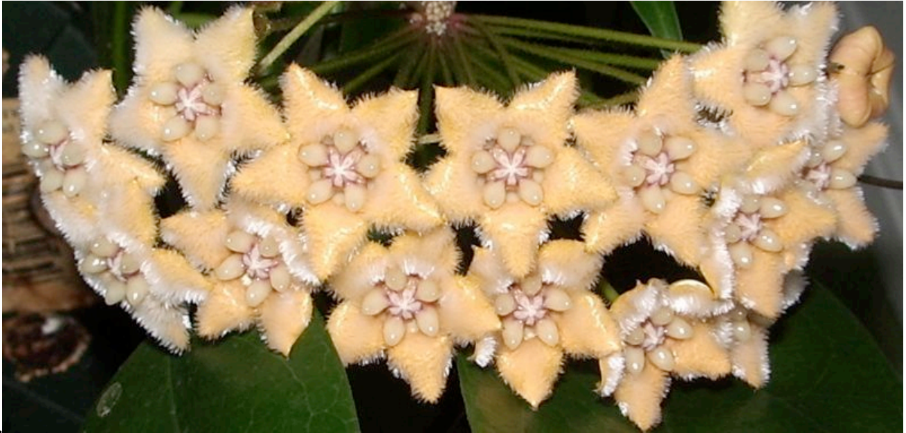
Figure 5: When newly opened, the flowers seem to be rotate.

H. fraterna performs well in bright indirect light, requiring no direct sun save an hour or two in the early morning or late afternoon. It will grow lushly in lower levels of light but will not flower as well. This plant grows well in intermediate temperatures (13'C to 35'C or 55'F to 95'F), as are found in most homes in temperate to subtropical areas of the globe.