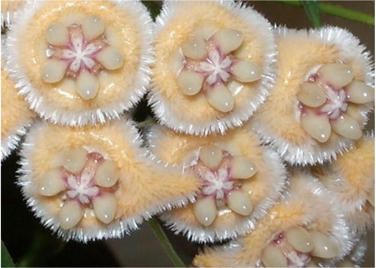
figure 6: the fully opened flowers of H. fraterna

The flowers, borne in huge clusters of up to 50 or more to each peduncle, are of a less common color for Hoyas- a deep rich gold. The corollas are very hairy, and the pink and ivory corona stands out prominently. The flowers of H. fraterna are distinctive right from the start- the sepals are very long and pointed, and enclose each developing bud in a pointed green "jacket", initially giving each bud the look of an unopened tulip bloom. The sepals gradually open to reveal developing buttery-yellow buds. The flowers begin to open when the buds are approximately 1.25cm wide, and at first seem to be rotate*. In the course of a day or two the corolla lobes will slowly reflex and point straight backwards. The corolla shoulders* are higher than in most reflexed Hoya flowers, leaving the face of the flower with a flat surface. The fully opened flowers are particularly beautiful when viewed from below, as each flower appears perfectly round and banded in gold.