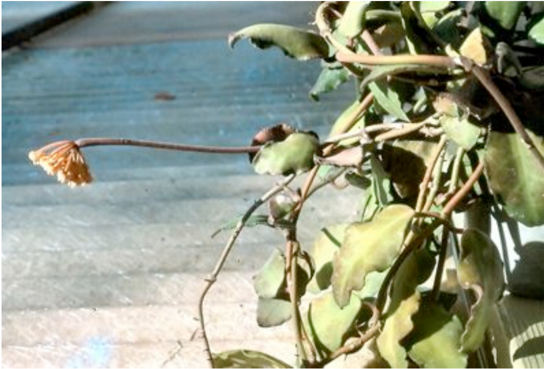
photo of Hoya waymaniae